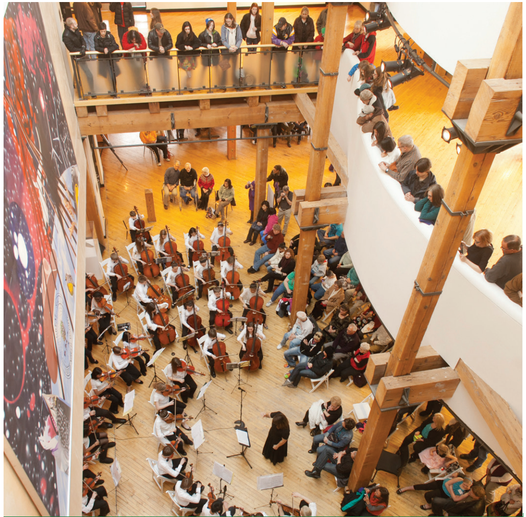
School Spirit Artists' Reception, Sunday, March 10, 2013.