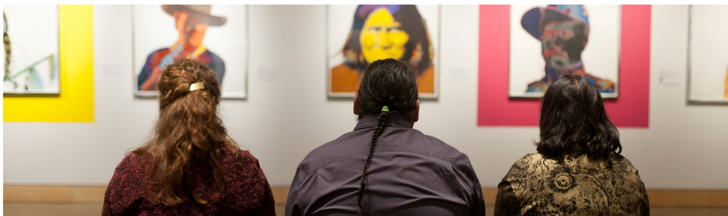
Andy Warhol: Creating Myth & Icon, February 3 – May 19, 2013, Exhibition sponsored in part by Sundog, photo Milestones Photography