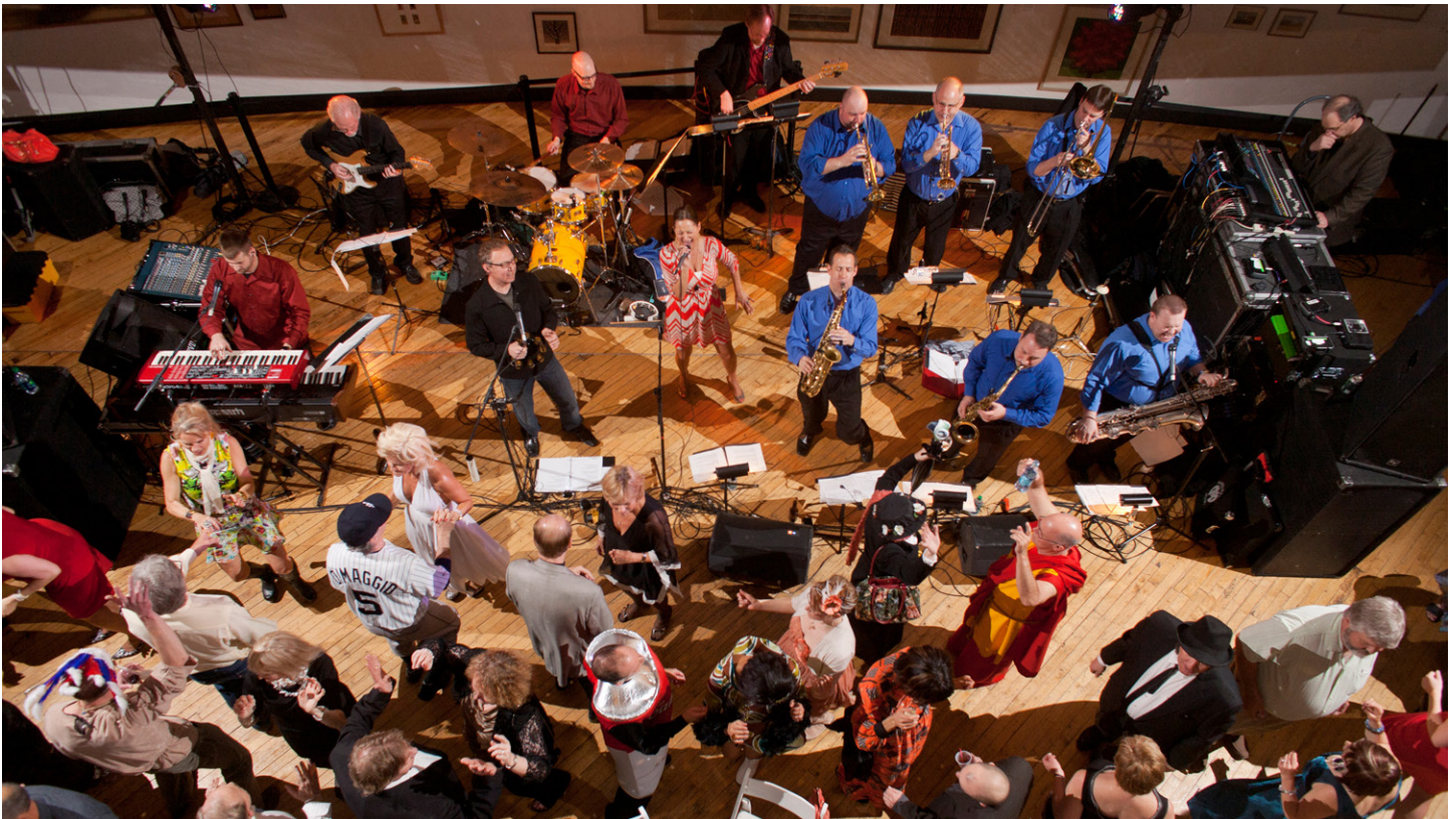
Fifteen Minutes of Fame: Spring Gala, Saturday, May, 4

Held the first Saturday of May every year to raise money for Museum education programs through an evening of music, hors d'oeuvres, dancing, and an art auction. Border States is the presenting sponsor, with additional major support from WDAY, H2M, Happy Harry's Bottle Shops, High Plains Reader, and Milestones Photography.