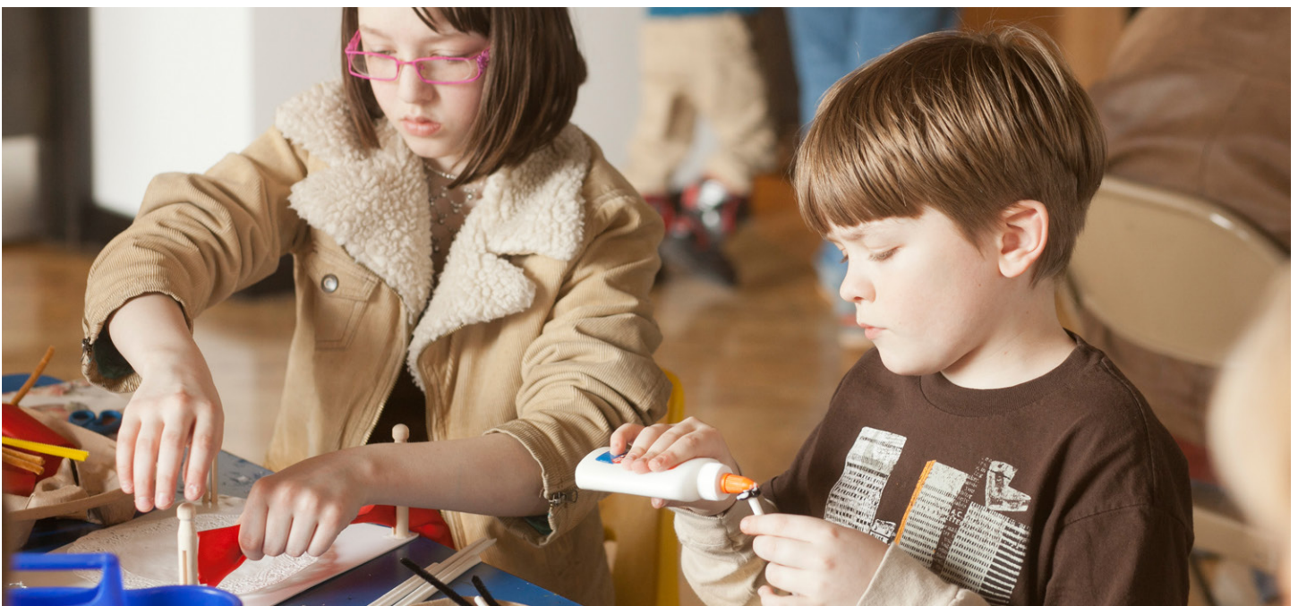
Kid Quest is a free, family program, held the first Saturday of the month from October through April.

Art-making classes for youth and adults offer opportunities for inquisitive people of all ages. Classes are held at the Katherine Kilbourne Burgum Center for Creativity, a multipurpose arts facility that also offers studio and exhibition space for learning, discussion, and display of creative work. Plains Art Museum's studio programs focus on developing people's potential for deeper learning and problem solving through 21st-century skills: creativity, collaboration, critical thinking, and communication. A skybridge connects the original museum building with this 25,500 square foot expansion.