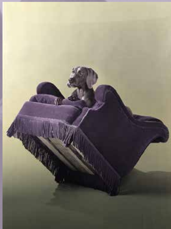
Ride, 1993, Color Lithograph, Anonymous Gift to Plains Art Museum