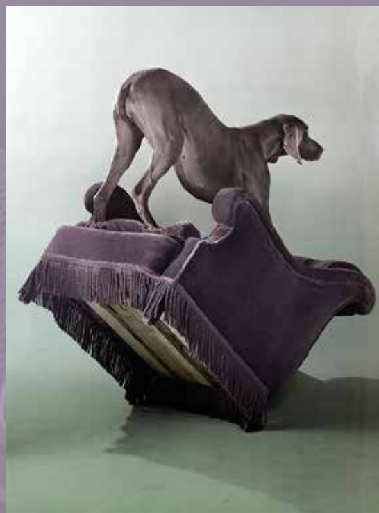
Override, 1993, Color Lithograph, Anonymous Gift to Plains Art Museum