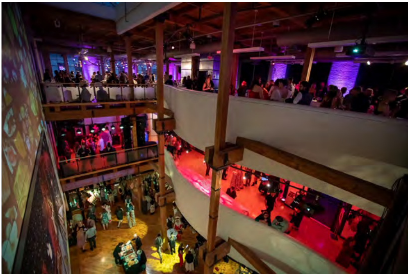
Position Profile | Chief Executive Officer, Plains Art Museum