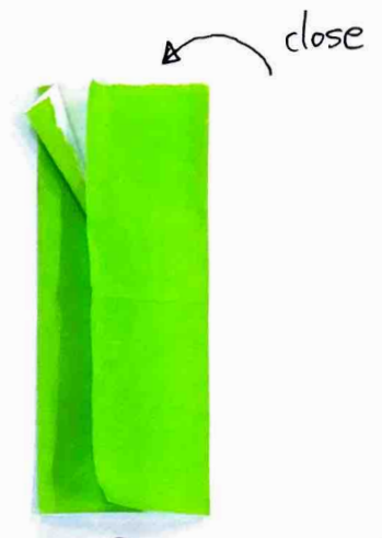
⑥ close it again