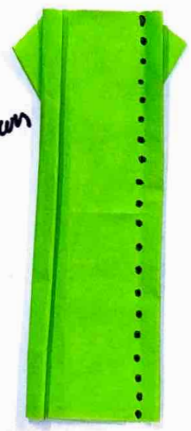
⑩ Fold both sides of the Yukata