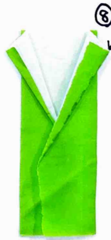
⑧ Fold in the middle line