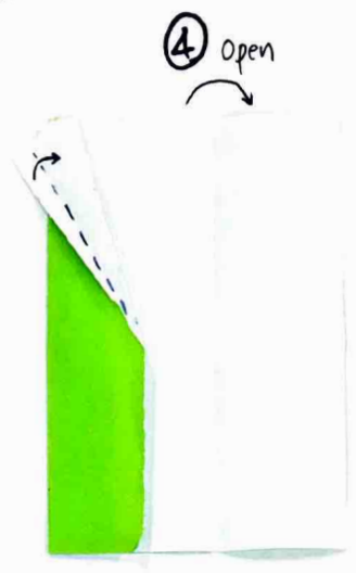
④ Open ⑤ Fold the collar part