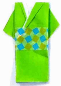
⑫ Flip it over and attach obi-belt