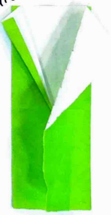
⑰ Fold another collar part