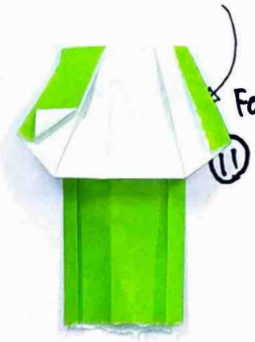
⑪ Fold it down